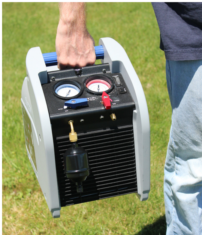
The lightweight design of Vortex Dual includes a 1 HP dual piston compressor that provides industry-leading recovery rates.