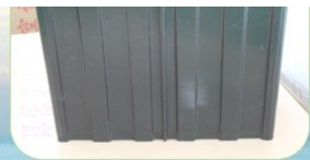
super big 50L water tank. Store enough water for 8 hours use