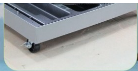
Durable strong base. Longer life time than other coolers