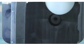
Auto water inlet valve. Ready to connect with continuous water supply pipe.