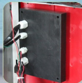
Sealed water proof control box. More stable electrical performance