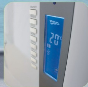
Luxury LCD display showing the temperature