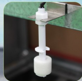
Water level probe, low water level warning and protect pump from working without water