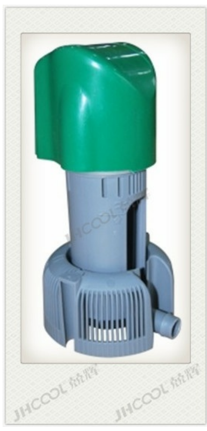
Drain Valve 50000 times super long life time drain old dirty water out of cooler automatically