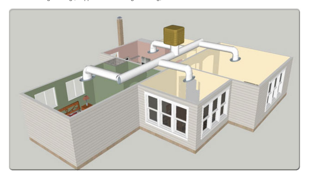
Higher quality standard

Suitable for big building , support 15~20m single ducting, or multi ducts be divided into 3\sim4 rooms.