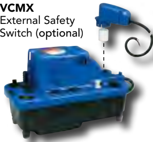
VCMX External Safety Switch (optional)